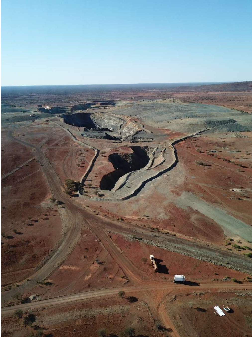
Figure 1 - Tumblegum South Gold Project location and historic pits along strike